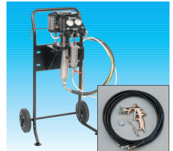
MX 12/31 12 litre per minute high volume pump