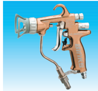
A4400M spray gun. Part no: 0909-4400-HF0000

Five year warranty on workmanship and materials on all Binks MX pumps